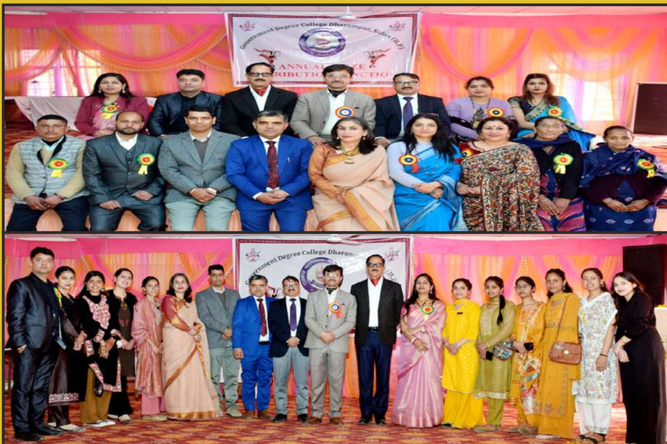
Inspection of college by SAR team of Internal Assessment and Ranking of the Govt. Colleges of H.P.